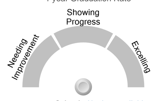
School No data available (Showing Progress: 90-94%, Excelling: 95-100%)